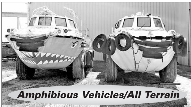
Amphibious Vehicles/All Terrain

Genset: MQ Power Whisperwatt 13 kw Spuds: (3) 12" Square w/Hydraulic Winches Overhauled, Sandblasted & Painted June 2018 Undocumented Vessel Location: Tampa, FL