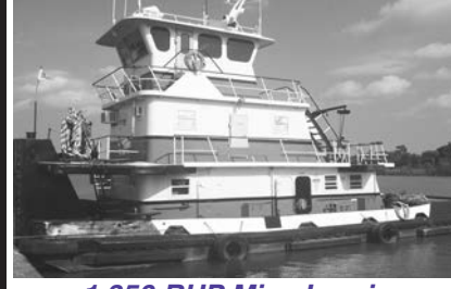
1,350 BHP Miss Laurie 65' x 24', Twin QSK Cummins (Tier II); MG 5170 (6:1), Flanking Rudders, Fleeting Deck, Elect. Winches.