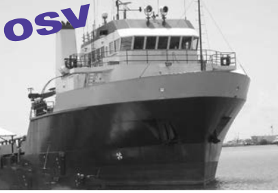
210' x 48', Blt. 1999, Twin Cats, 190k Fuel, 120k Water, Bulk, Liq., DP, Solas.