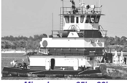
Miss Jenney 65' x 22' 800 HP, Twin GM 12v71's MG 514 (6:1) Flk Rudders; Elect. Winches; RCP.