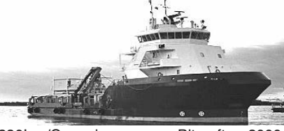
230' w/Cummins power; Blt. after 2000. Full ABS, Solas, DP-2.