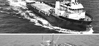
220' x 46' Mariner w/stern thrusters DP1 EMD Power 2000 blt.