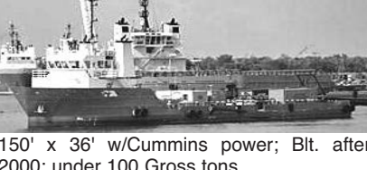
150' x 36' w/Cummins power; Blt. after 2000; under 100 Gross tons.