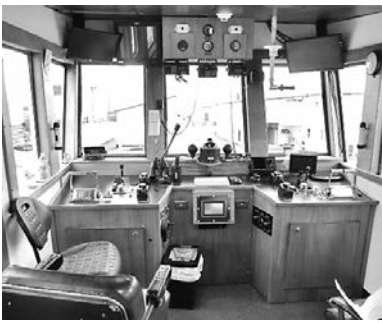
Twin EMD 16-645 E5 Turbo's + 62 tons bollard pull. Make Offer! Mint Condition.