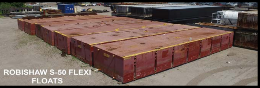
ROBISHAW S-50 FLEXI FLOATS