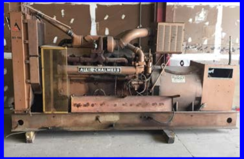
3 Each Allis Chalmers 475 KW GENSETS