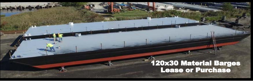
120x30 Material Barges Lease or Purchase