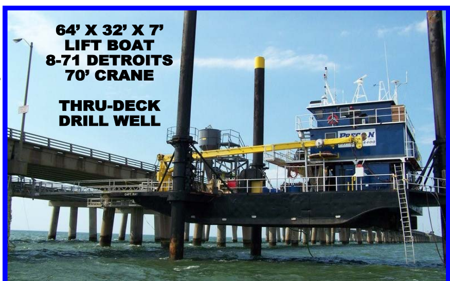
64' X 32' X 7' LIFT BOAT 8-71 DETROITS 70' CRANE

ALL CRANES HAVE CURRENT INSPECTIONS AND READY TO WORK. OPERATORS AVAILABLE ALSO.