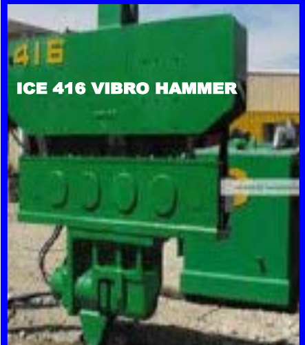
ICE 416 VIBRO HAMMER