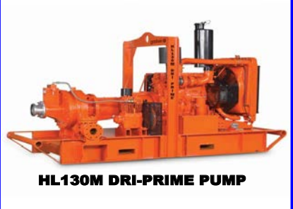
HL130M DRI-PRIME PUMP

CONTACT: MACON HODGES, (757) 439-9963 MHODGES@PRECONMARINE.COM FOR ADDITIONAL EQUIPMENT CHECK OUT: PRECONMARINE.COM/EQUIPMENT ALL EQUIPMENT—FOR SALE OR LEASE