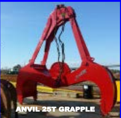
ANVIL 25T GRAPPLE