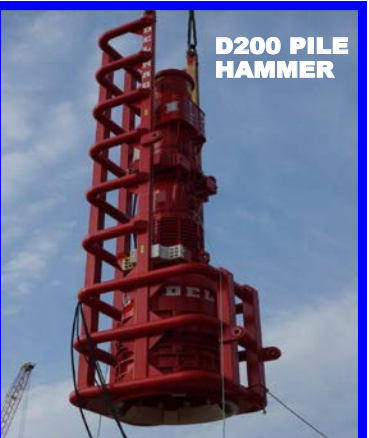
D200 PILE HAMMER