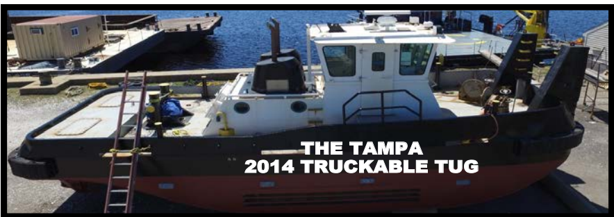
THE TAMPA 2014 TRUCKABLE TUG