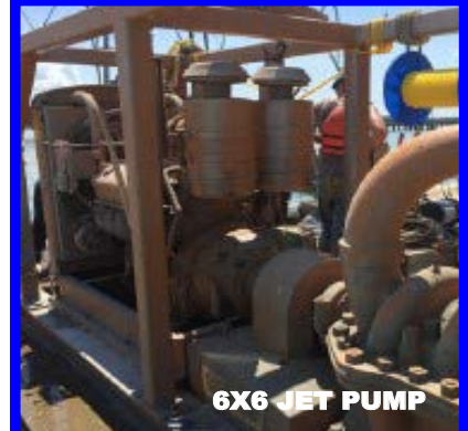
6X6 JET PUMP