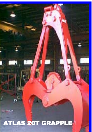
ATLAS 20T GRAPPLE