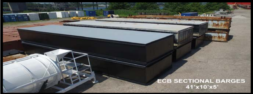
ECB SECTIONAL BARGES 41'x10'x5'