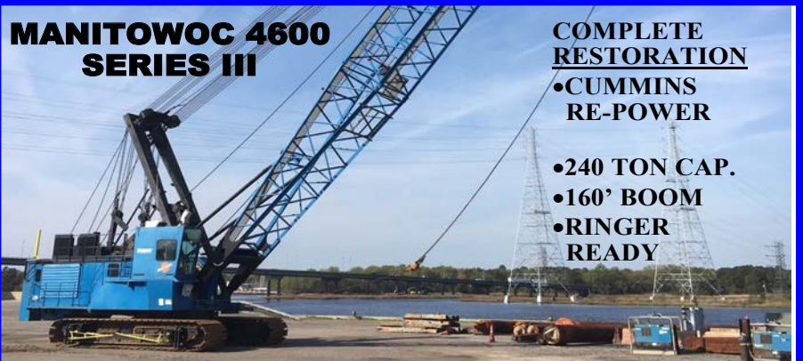
MANITOWOC 4600 SERIES III