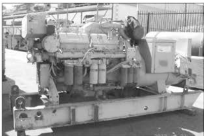
1982 Cat 3412 DITA , S/N: 81Z01608, 59095 Hrs, ENGINE ONLY ..... $10,600 USD