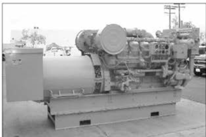
1993 Cat 3512 DITA , S/N: 24Z05460, 654 Hrs, Unit has been checked out, load tested and painted ..... $124,500 USD