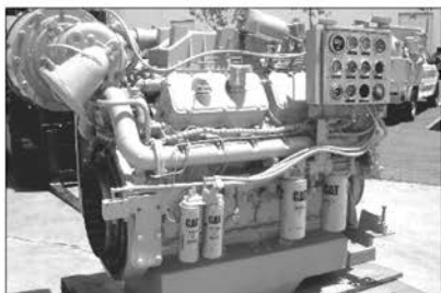
1989 Cat 3412 DITA , S/N: 60M03929, 6757 Hrs, Serviced, Dyno Tested, Painted, 764 Hp @ 2100 RPM ..... $55,200 USD