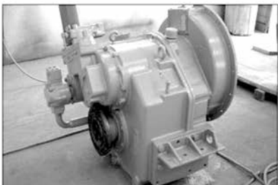
1985 Twin Disc MG 518-1 , S/N: 3N1413, 1800 RPM, Rebuilt in 03/2009, Continuous Duty ..... $12,500 USD