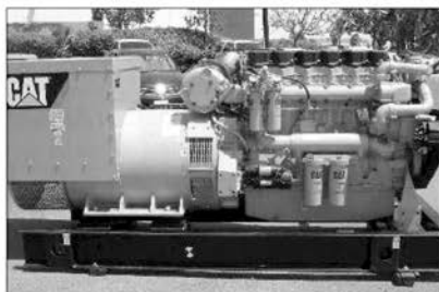
2006 Cat C18 DITA , S/N: CYG00167, 4000 Hrs, Rated 450kW Prime, 400 V, 3 Phase, 50 Hz, 1500 RPM ..... $49,500 USD