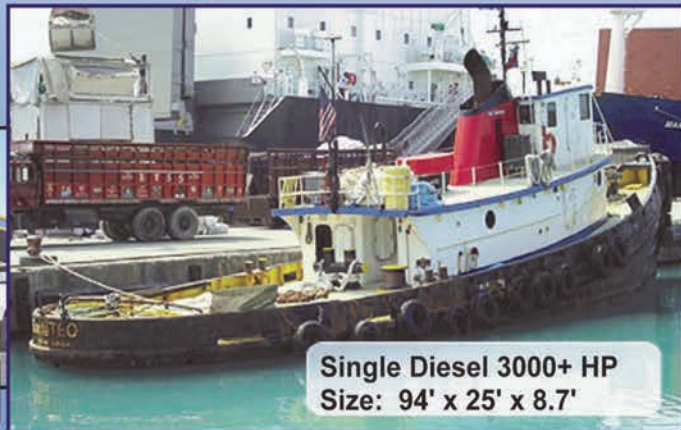
Single Diesel 3000+ HP Size: 94' x 25' x 8.7'