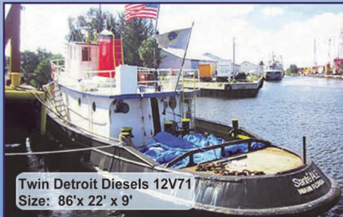
Twin Detroit Diesels 12V71 Size: 86' x 22' x 9'