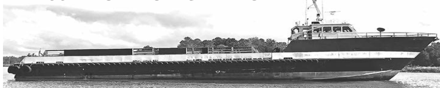
Built in 2005 • Caterpillar Powered • US Flag