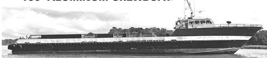
Built in 2003 • Caterpillar Powered • US Flag