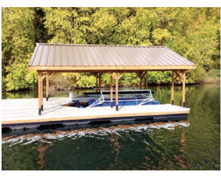
RESIDENTIAL COVERED DOCK WITH THRU-FLOW DECKING