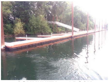
COMMUNITY 400' DOCK