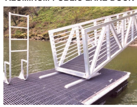
ALUMINUM 80' RAMP