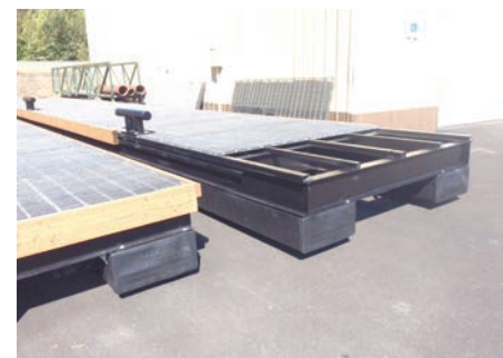
STEEL FRAMED COMMERCIAL DOCK

Established in 1982, KFS DOCKS constructs high quality boat docks, marinas, and gangway ramps. Specializing in both welded aluminum or steel construction, we build durable, functional, and attractive boat docks designed to each client's unique specifications. Our Ramps are aluminum construction approved for Residential or Commercial use up to 80' in length. We also distribute high grade roto-molded floats, available for individual purchase for your dock build or floatation upgrade. In addition, KFS DOCKS has an extensive array of dock and marine accessories. Contact us today for any questions, orders, or a personalized quote.