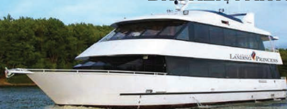
Landing Princess Skipperliner Dinner Cruise Yacht

LAKE QUEEN Sightseeing Paddlewheeler Skipperliner (1996) 96' (LOA) 20' Breadth 3116 Caterpillar 149 Passengers Engine Hours: Port & Starboard-14651