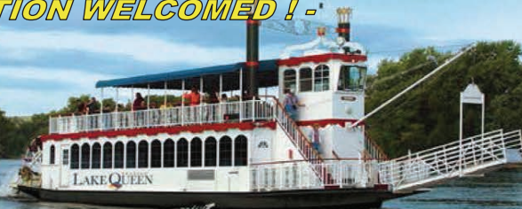
Lake Queen Skipperliner - Sightseeing Paddlewheeler