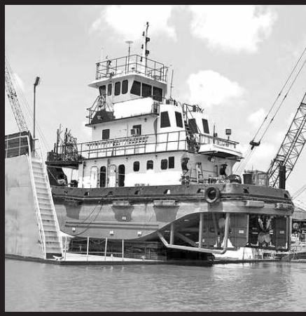
1,200 BHP 60' x 24'

Blt. 1989, Twin Cat 3408's, MG 518 (6.5:1) flanking rudders, Fleeting Deck, Elect. winches RCP, completely rebuilt, RCP Cert.