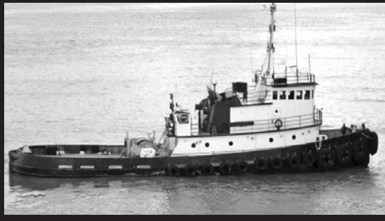
LARGE - 4,000 BHP William - 115' x 32'

Twin Cummins QSK 38M's Tier II, with ZF 4610W 5.63:1, Korts, Upper House, ABS International Loadline Valid.