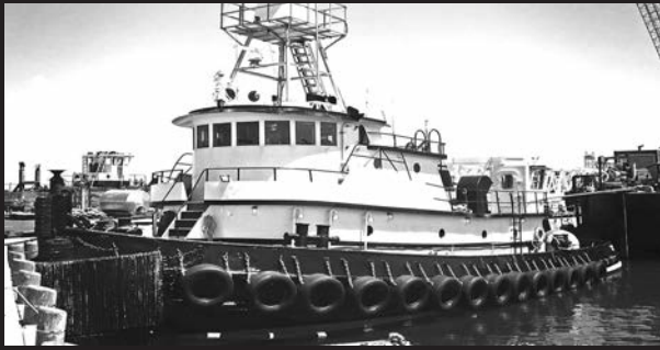
MEDIUM - 2,600 BHP Lucinda Smith 90' x 28'

Twin Cummins QSK 38M's Tier II, with ZF 4610W 5.63:1, Korts, Upper House, ABS International Loadline Valid.