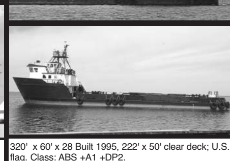
320' x 60' x 28 Built 1995, 222' x 50' clear deck; U.S. flag. Class: ABS +A1 +DP2.

Twin CAT C-32's (Tier II), MG 5222 (6:1), Flanking Rudders, Fleeting Deck, Elect Winches