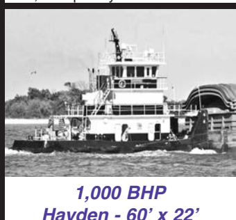
1,000 BHP Hayden - 60' x 22'

Utility Boat: 110' L x 28' B x 8' loaded draft. Built in 1982, U.S. Flag. Deck Cargo: 60LT on 62' x 22' clear deck. U.S. Gulf Coast.