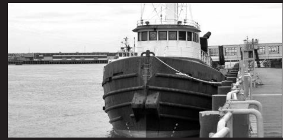
XXX LARGE - 5,750 BHP Costal 303 128' x 35'

Twin EMD 16-645 E6's, Reintjes, Korts, ABS Full Class Hull and Machinery Valid, Intercon Double Drum Winch, Rent Ready.