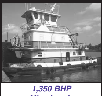
1,350 BHP Miss Laurie 65' x 24'

Blt. 80's, Rebuilt Repower 2011, Twin Cummins KT 19M3's, MG 518 (6.5:1), Fleet Deck, Elec. Winches RCP, Completely Rebuilt RCP Cert.