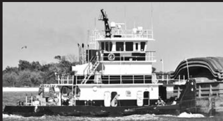
1,000 BHP Hayden - 60' x 22'

1000 Hp Model Bow Luger Tug; 60' x 24' with 5'-6" shallow draft; totally reconditioned; (2) Cat 3406's; MG514 (5:1); (2) Cummins Gensets; 17,000 Fuel, 17,000 Water, subchapter M ready with audits complete.