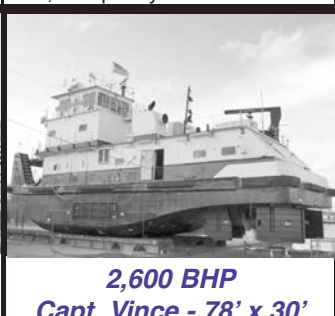
2,600 BHP Capt. Vince - 78' x 30'

Twin CAT 3408's, MG518 (6.5:1) Flk. Rudders, Fleet Deck, Elect. Winches, MMBumpers. SUPER BARGAIN!