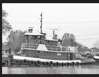
800 HP - Vivian 60' x 22'

6' Draft, Blt 1975, Twin Screw GM 12V71's, MG 514 (5.16:1), Steel In Subchapter M Condition