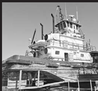
1,000 BHP - 60' x 23'

Built 1989, Twin CAT 3408's, MG 518 (6.5:1) Flanking Rudders, Fleeting Deck, Elect. Winches RCP, Completely Rebuilt RCP Cert.