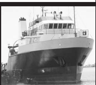
210' x 48', Blt. 1999, Twin CAT's, 190k Fuel, 120k Water, Bulk, Liq., DP, Solas.

Built 2010, ABS Full Class, Hull & Machinery Mint Condition (3,200 Built 2010)