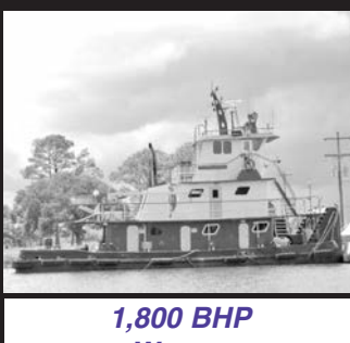
1,800 BHP Warren 65' x 26'

Twin QSK Cummins (Tier II); MG 5170 (6:1), Flanking Rudders, Fleeting Deck, Elect. Winches