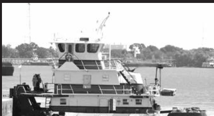
1,350 BHP Miss Laurie - 65' x 24'

Twin Cat 3408's, MG518 (6.5:1), flanking rudders, fleeting deck, elec. winches, MM Bumpers, Super Bargain. Two rebuilt gen sets July 2017