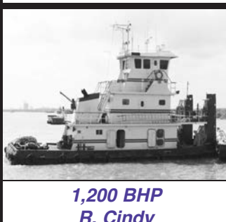
1,200 BHP R. Cindy 60' x 22'

Built 1982, Rebuilt 2013, ex ABS Full Class, Twin GM16V149's, 540 (6:1)