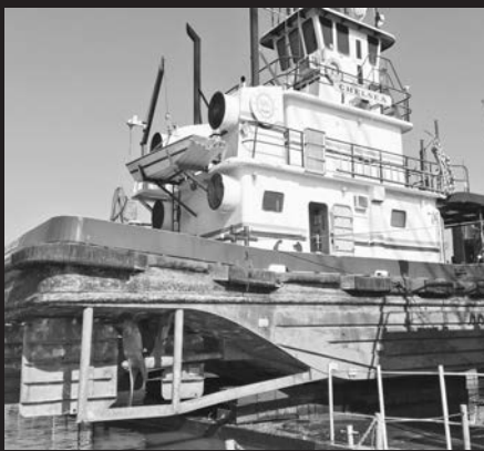
1,000 BHP Chelsea - 60' x 23'

Blt. 1989, Twin Cat 3408's, MG 518 (6.5:1) flanking rudders, Fleeting Deck, Elect. winches RCP, completely rebuilt, RCP Cert.