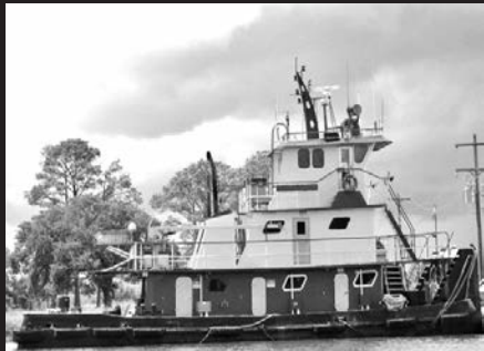
1,800 BHP Warren - 65' x 26'

Twin QSK Cummins (Tier II), MG 5170 (6:1), Flk Rudders, fleeting deck, electric winches. 9,000 fuel, 4,000 water.