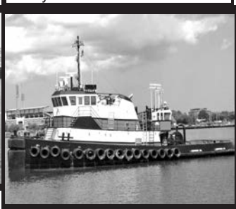
3,400 BHP 95' x 32'

Twin Alco 16-251 E's, Built Main, Upper House With Elevator, ABS Laidup Status.