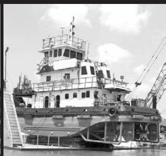
1,200 BHP - 60' x 24'

Built 1989, Twin CAT 3408's, MG 518 (6.5:1) Flanking Rudders, Fleeting Deck, Elect. Winches RCP, Completely Rebuilt RCP Cert.