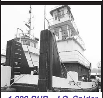
1,800 BHP - J.C. Spider 72' x 28'

Blt. 1982, Rebuilt 2015 Dravo, Twin CAT 3512's, MG 5600 (7:1), 78' x 68", RCP Cert. & SubM 2,600 Profile