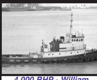
4,000 BHP - William 115' x 32'

Twin Cummins QSK 38M's Tier II, With ZF 4610W, 5.63:1, Korts, Upper House, ABS International Loadline Valid