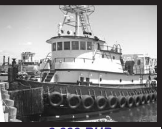
2,600 BHP Lucinda Smith 90' x 28'

(2) CAT 3406's, MG 516 (5:1), Totally Reconditioned, 5'-6" Shallow Draft, Cummins Gensets, 17,000 Fuel, 17,000 Water, Subchapter M Ready