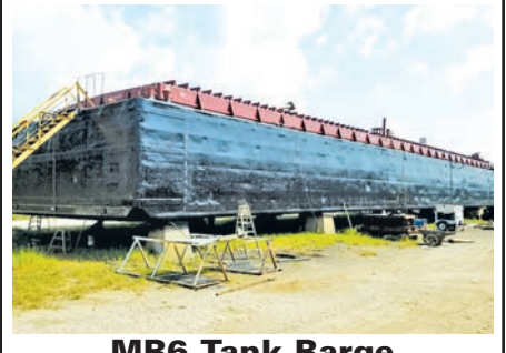
MB6 Tank Barge 11,000 BBL Volumetric Double Hull 195' x 35' x 12'6", Vapor Recovery System Currently Undergoing USCG Drydock Credit