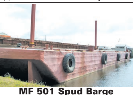
For Sale / Charter 192' x 42' x 10', 24" x 45' Heavy Square Spuds, Hydraulically Operated 40.000 Lb. Winches