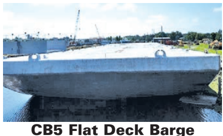
For Sale / Charter Being Converted To Spud Barge! Built: 1982, 240' x 72' x 15' New EnRust Internal Coatings / Exterior Epoxy Coating

Contact Us Today: www.mbbrokerage.net cgonsoul@gmail.com • (850) 255 5266