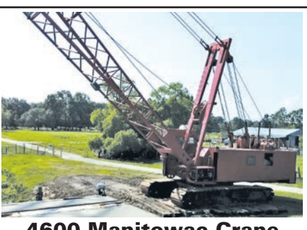
4600 Manitowac Crane (2) Digging Buckets, 5 Yard & 7 Yard Sold Seperately, Buckets Sold As Pair For $75K Only $375K!!!