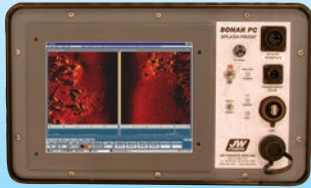
Splash Proof PC Available