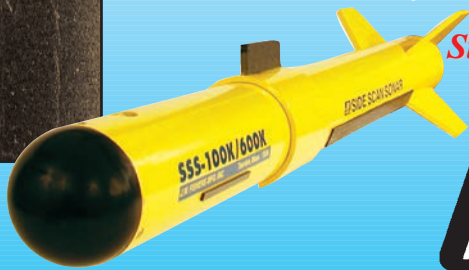
Side Scan System Only $20,995