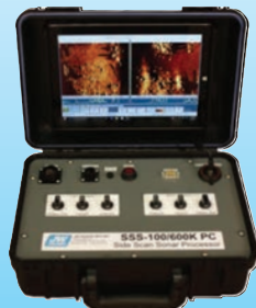
Tablet mounted in control box cover available